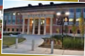
Southern Arkansas University