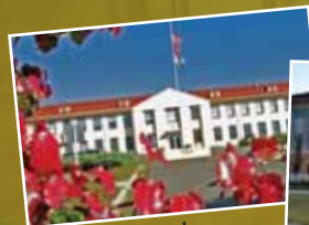
Southern Arkansas University Tech

We expect that you want to be located in a community with an educational system that both trains and grows the kind of skills that your employees need. Our colleges provide technical expertise and training to our industries. Among their curriculum strengths are: Aerospace, Engineering, Process Control Systems, Computer Engineering, Welding, and Industrial Equipment Maintenance.